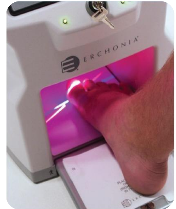
40662 – Before / After 8/12/10 – 4/22/10